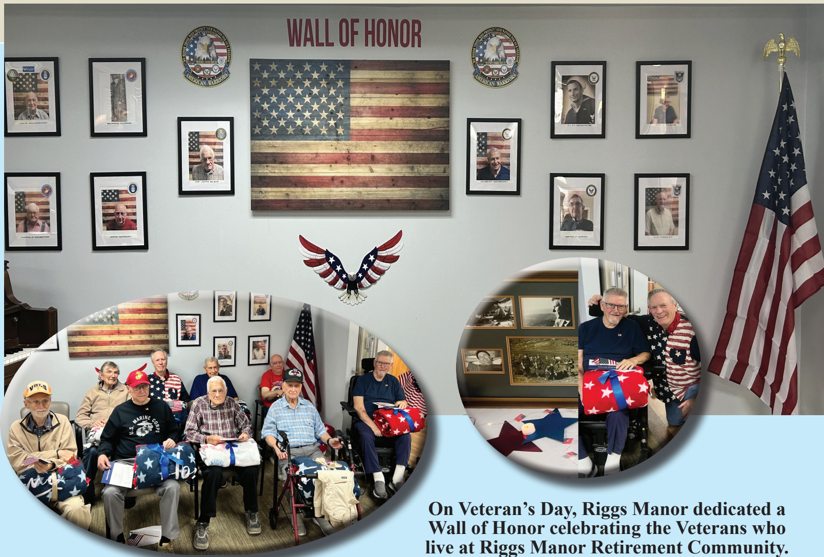
On Veteran’s Day, Riggs Manor dedicated a Wall of Honor celebrating the Veterans who live at Riggs Manor Retirement Community.